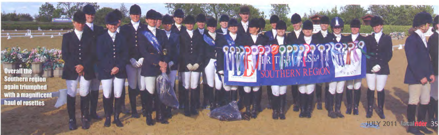
Overall the Southern region again triumphed with a magnificent haul of rosettes