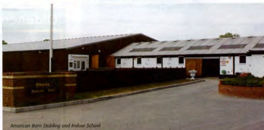
American Barn Stabling and Indoor School